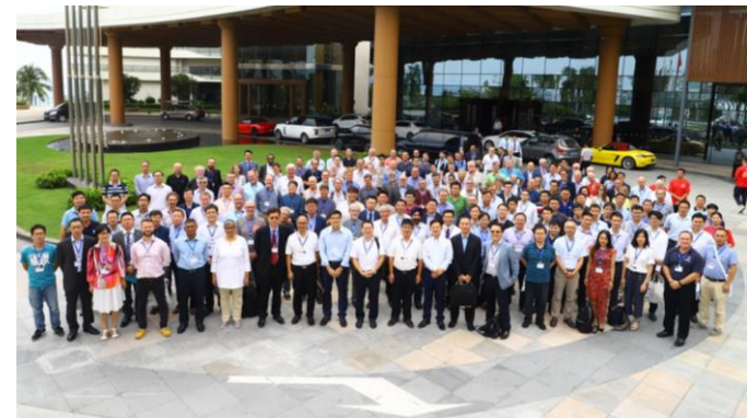
UMC 2019 participants: Sanya, China