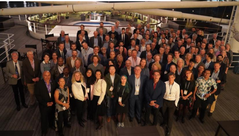
UMC 2023 participants: SS Rotterdam, Natherlands