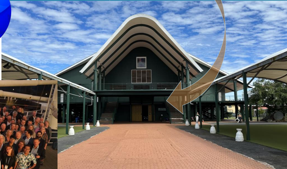
National Auditorium, Rarotonga, Cook Islands